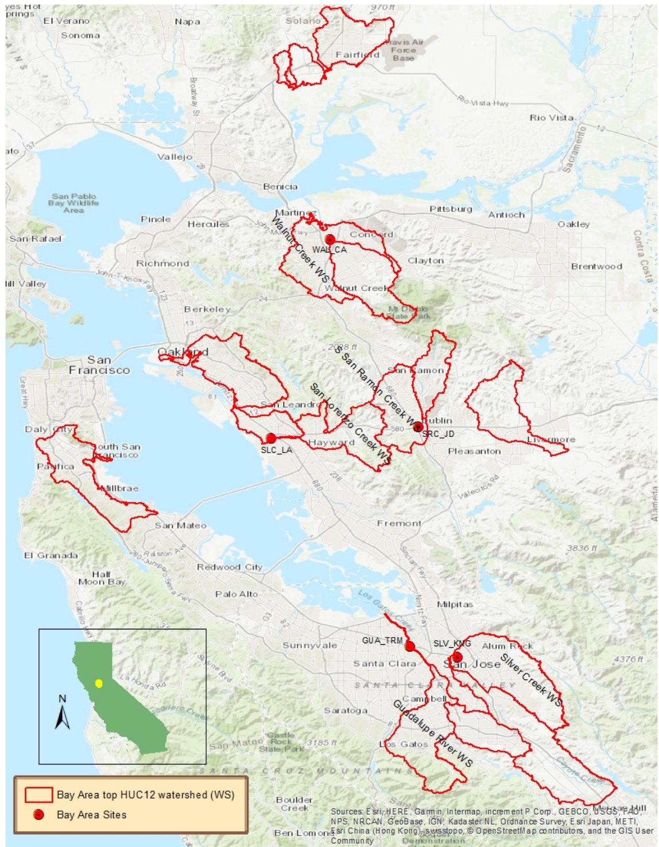
Figure 2. San Francisco Bay area monitoring sites and top HUC12 watersheds for FY 2019/2020.