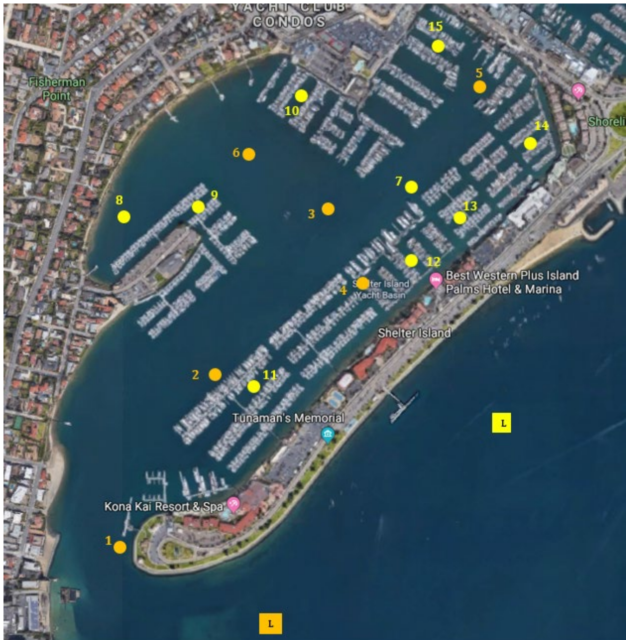
Figure 8. Sampling locations within Shelter Island Yacht Basin. Orange markers are sites that will be sampled by the Port of San Diego on the same sampling trip.