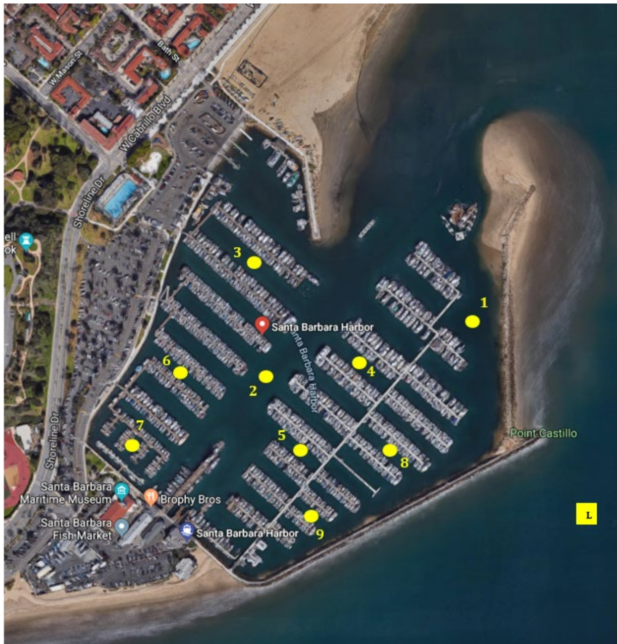
Figure 3. Sampling locations within Santa Barbara Harbor.