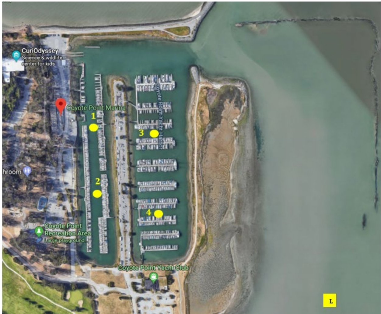
Figure 2. Sampling locations within Coyote Point Marina.