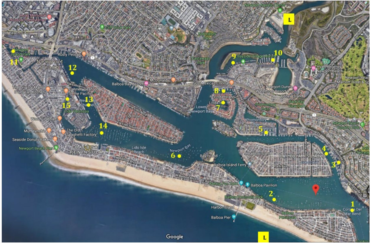
Figure 7. Sampling locations within Newport Harbor.