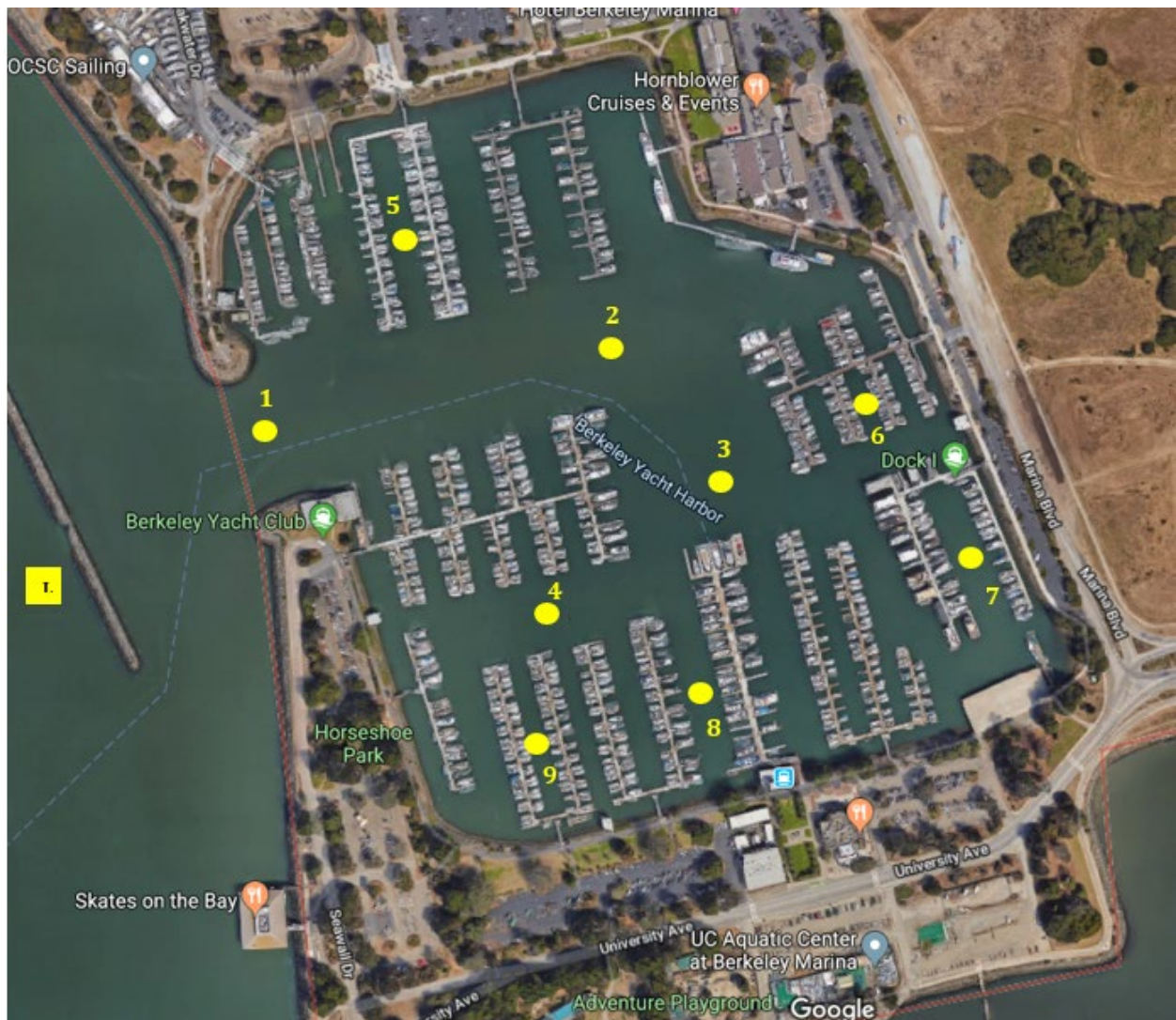
Figure 1. Sampling locations within Berkeley Marina.