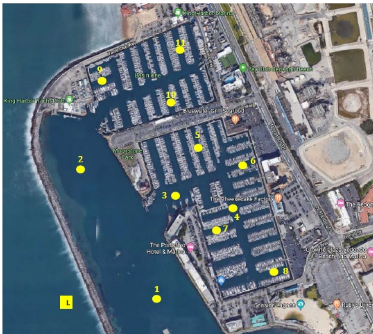
Figure 4. Sampling locations within the King Harbor Marina.