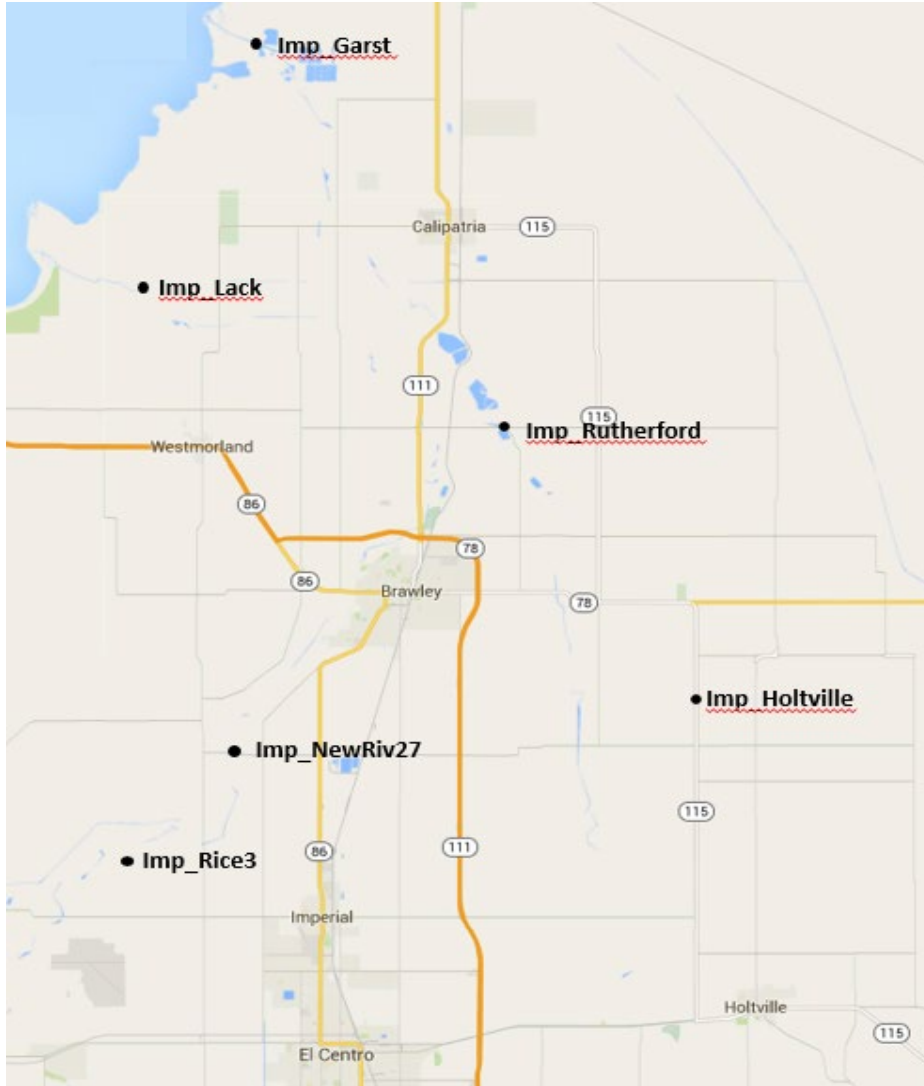
Figure 1. Monitoring Sites in Alamo River and New River in Imperial County.