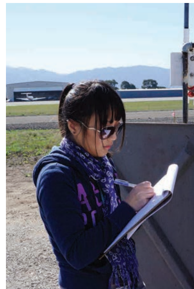
DPR operates a network of air monitoring stations in farming regions.

The Pest Management and Licensing Branch has five major programs. The Pest Management Analysis and Planning Program evaluates pesticide and pest management problems and awards grants to develop and promote new strategies that reduce adverse environmental effects and hazards from pesticide use in agricultural, nonagricultural and urban settings. The Pesticide Use Reporting Program collects, reviews and analyzes pesticide use data in California. The Endangered Species Project maps habitats of federally listed species, evaluates pesticide exposure risks on inhabited sites, and develops protective strategies to minimize those risks. The Licensing and Certification Program examines and licenses those who sell, apply commercially, or consult on the use of pesticides. It also accredits continuing education courses and collaborates with the University of California for the development of license exam study guides and exam