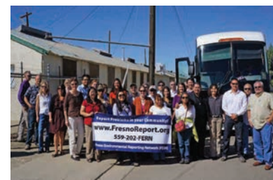
As part of its environmental justice efforts, DPR works with community groups like the Fresno Environmental Reporting Network to monitor and help solve issues that threaten the health of community members.