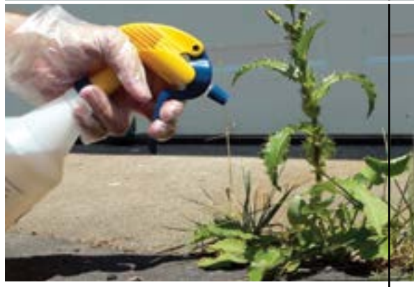
Anyone who uses pesticides – whether a farmer, professional pest control company, your neighbor, or you – must follow the law and the pesticide label and be careful to avoid harming themselves, anyone else or the environment.