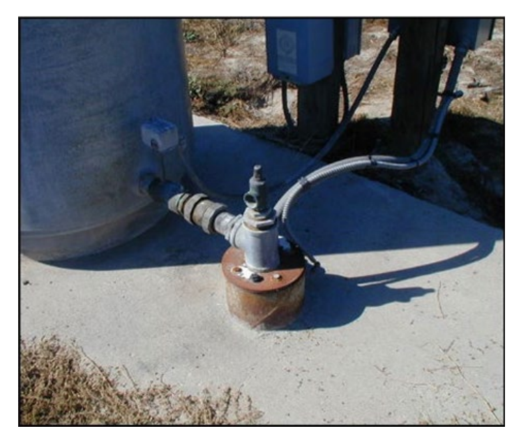
Figure 1: The well casing is the six-inch steel pipe that is slightly rusted.