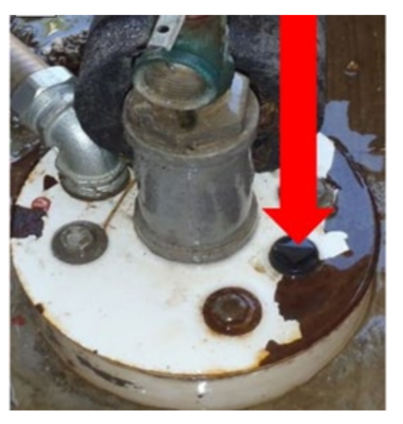
Figure 2: Test port on the casing cap