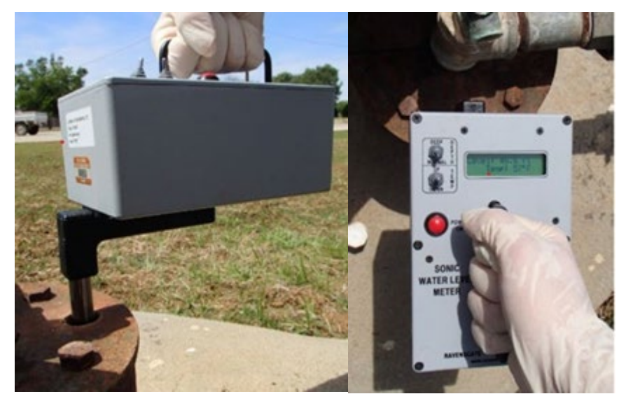
Figure 4: Left - Placement of the SWLM into the test port; Right - LCD screen reading of water level measurement.

3.2.4 Remove the red cap from the end of the probe and position the instrument over the well cap with the probe inside the port (Figure 4). Sometimes, the rubber seal in the well cap can be misaligned, obscuring the hole. If the hole is mostly open, try to wiggle the probe into the port. The end of the probe screen must not be obstructed. If it is obstructed, the SWLM will return an erroneously low value.