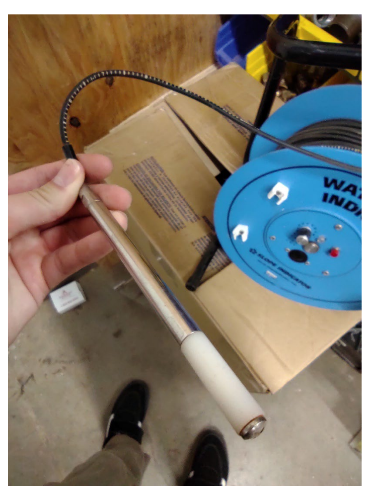
Figure 6: Probe and Cable

3.3.5 Read the level indicated on the cable where it meets the wellhead. This is the water level in the well. Record this measurement on the well information sheet.