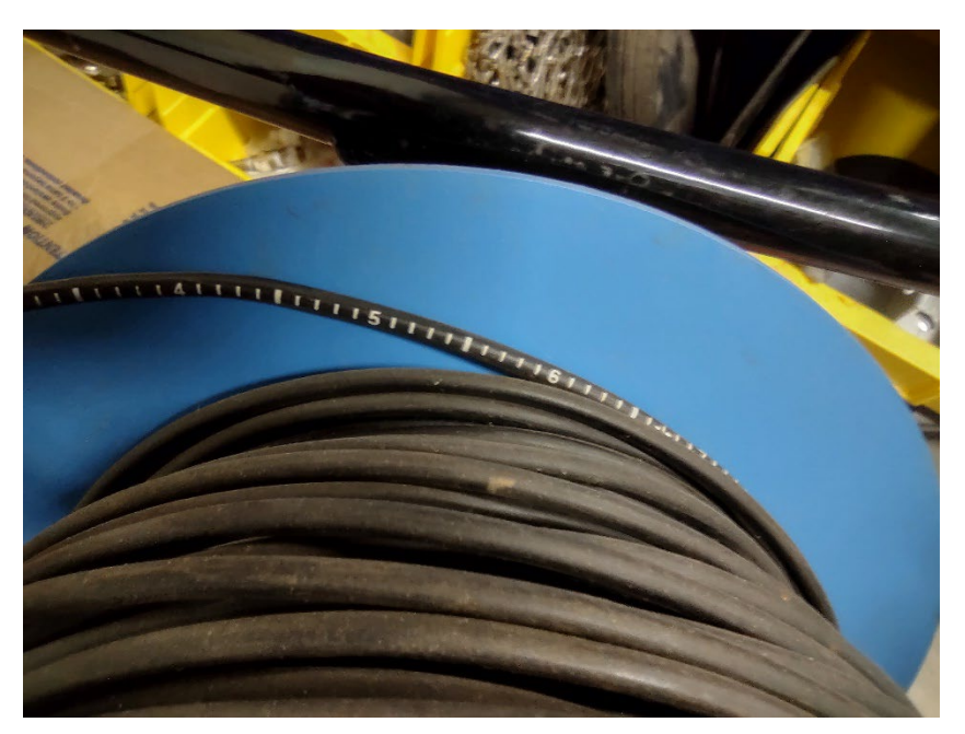
Figure 7: Cable Notches