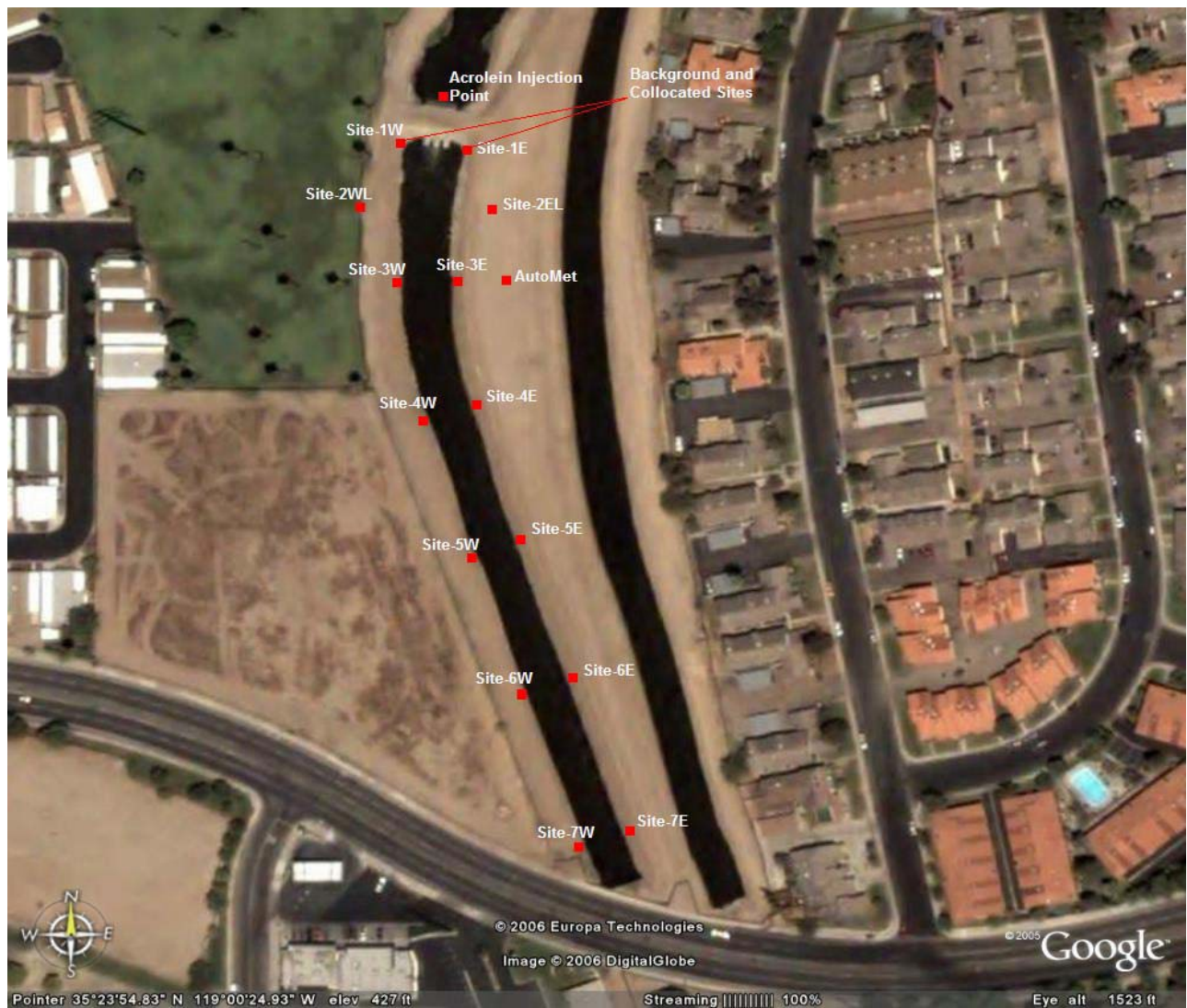
AERIAL PHOTO OF KERN ISLAND CANAL SAMPLING SITES