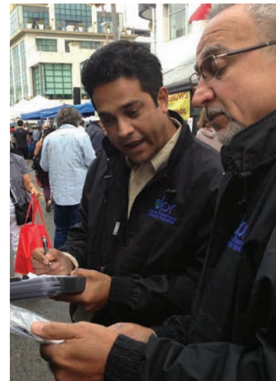
DPR scientists collect produce samples at a Southern California farmers market in 2013.

In response to Britain’s 1926 threat of an embargo, the California Legislature passed the Chemical Spray Residue Act (Statutes of 1927, Chapter 807) “to prevent the seizure of California fruits and vegetables on interstate and foreign markets.” The legislation made it illegal to pack, ship or sell fruits or vegetables with harmful pesticide residues. It gave the California Department of Agriculture (CDA) the authority to seize fresh products which, in the “judgment” of inspectors, “carry spray residue or other added deleterious ingredients,” pending chemical analysis. If analysis showed illegal residues, shippers were allowed to try to wash off the residues. The new law also set residue tolerances identical to those set by the federal government.