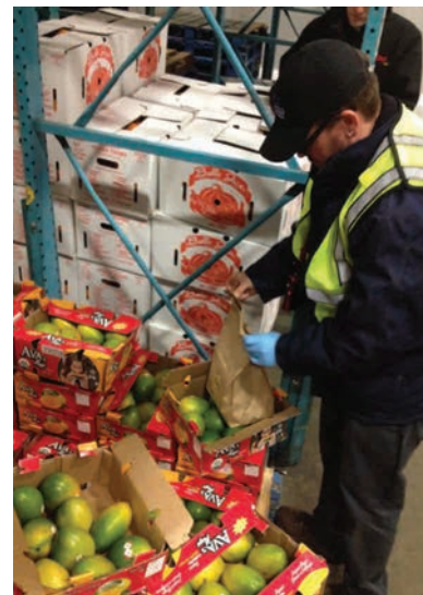
A DPR scientist collects produce samples for residue testing from a grocery distribution center.

Because accurate dietary exposure assessment requires data on even minute traces of residues, multi-residue methods were enhanced to be sensitive to residue levels of significantly less than 50 parts per billion. California's participation in PDP helped produce significant improvements to the multi-residue screens that can simultaneously detect many pesticides.