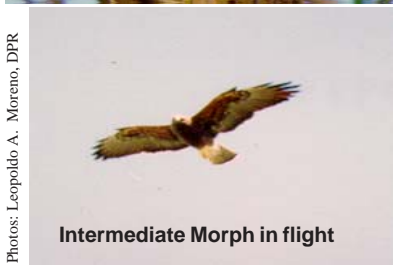
Intermediate Morph in flight