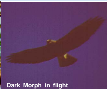
Dark Morph in flight