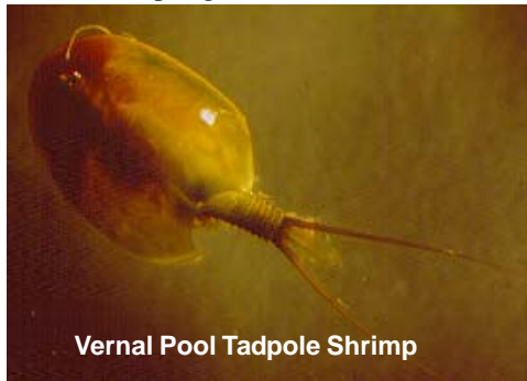
Vernal Pool Tadpole Shrimp

Vernal pool shrimp are generally 1 - 1.5 inches long. Fairy shrimp are usually translucent, while tadpole shrimp are a light to dark brown. As dictated by their ephemeral habitat, fairy shrimp have short life spans.