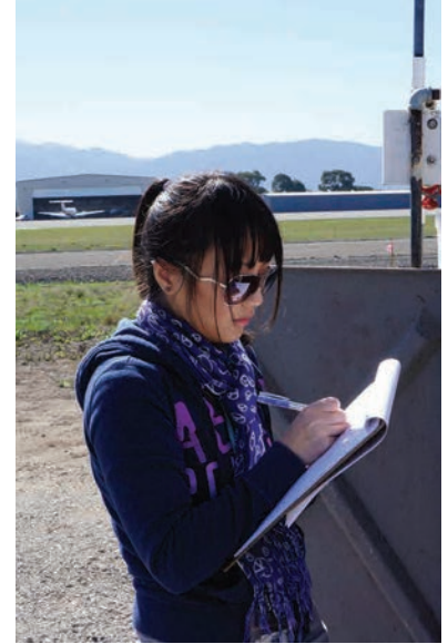
DPR operates a network of air monitoring stations in farming regions.

The Pest Management and Licensing Branch has five major programs. The Pest Management Analysis and Planning Program evaluates pesticide and pest management problems and awards grants to develop and promote new strategies that reduce adverse environmental effects and hazards from pesticide use in agricultural, nonagricultural and urban settings. The Pesticide Use Reporting Program collects, reviews and analyzes pesticide use data in California. The Endangered Species Project maps habitats of federally listed species, evaluates pesticide exposure risks on inhabited sites, and develops protective strategies to minimize those risks. The Licensing and Certification Program examines and licenses those who sell, apply commercially, or consult on the use of pesticides. It also accredits continuing education courses and collaborates with the University of California for the development of license exam study guides and exam