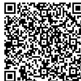
SPARC website QR code

All SPARC meetings will be open to the public and include opportunities for public comment. Meeting links and documents will be posted on the SPARC webpage .