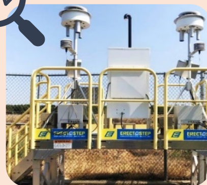
Monitoring station (9x9 ft)