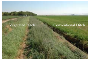
Photo B. Vegetated and conventional ditches prior to runoff