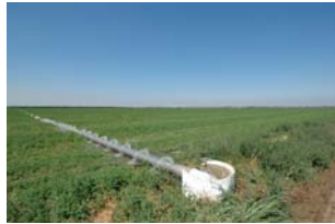
Photo A. Flood Irrigation at study site using gated pipe