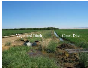
Photo C. Vegetated and conventional ditches during runoff event